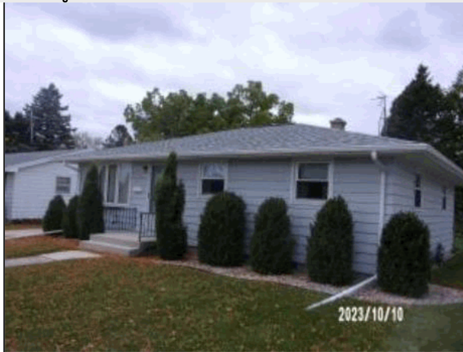
Total living area is 1,008 SF; building assessed value is $143,100