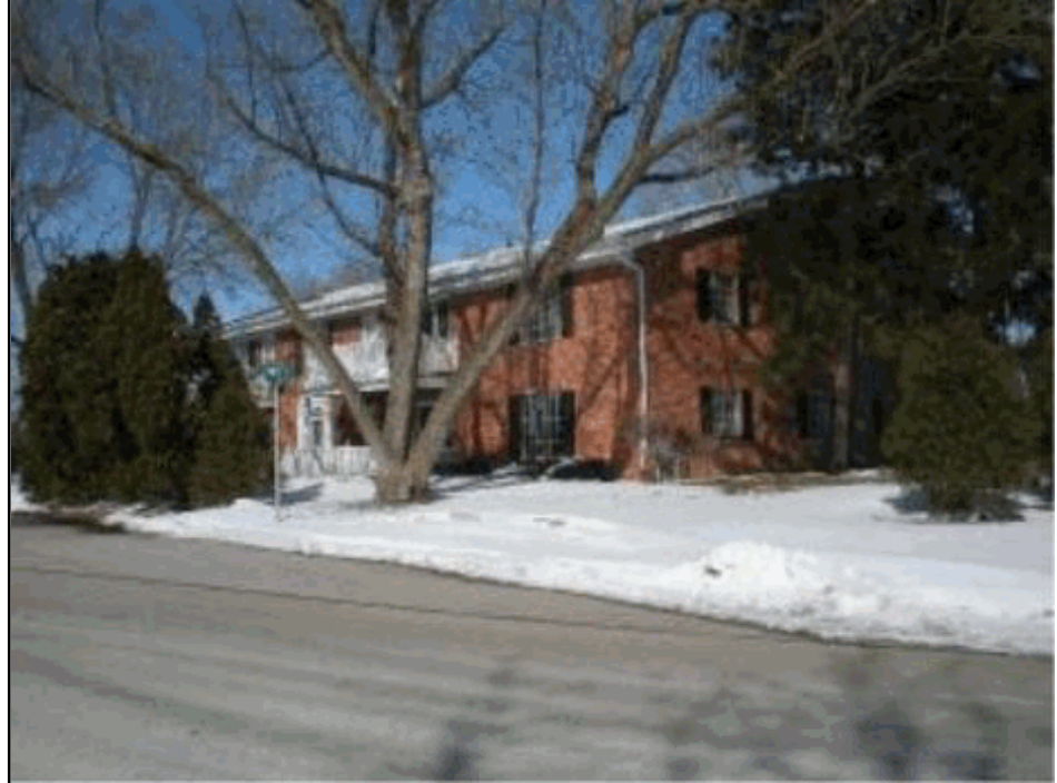
Total living area is 1,102 SF; building assessed value is $129,100