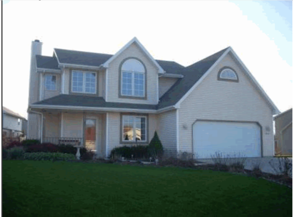
Total living area is 1,782 SF; building assessed value is $171,500