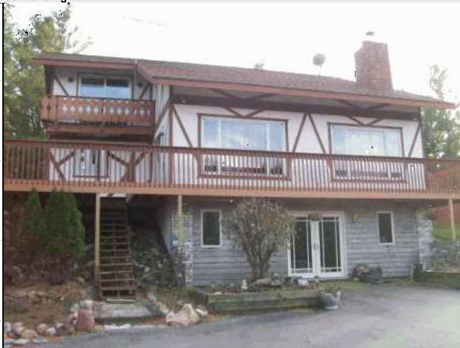
Total living area is 2,480 SF; building assessed value is $154,200