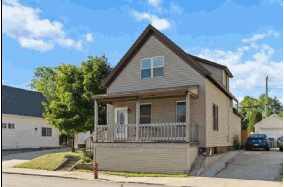
Total living area is 1,649 SF; building assessed value is $113,600