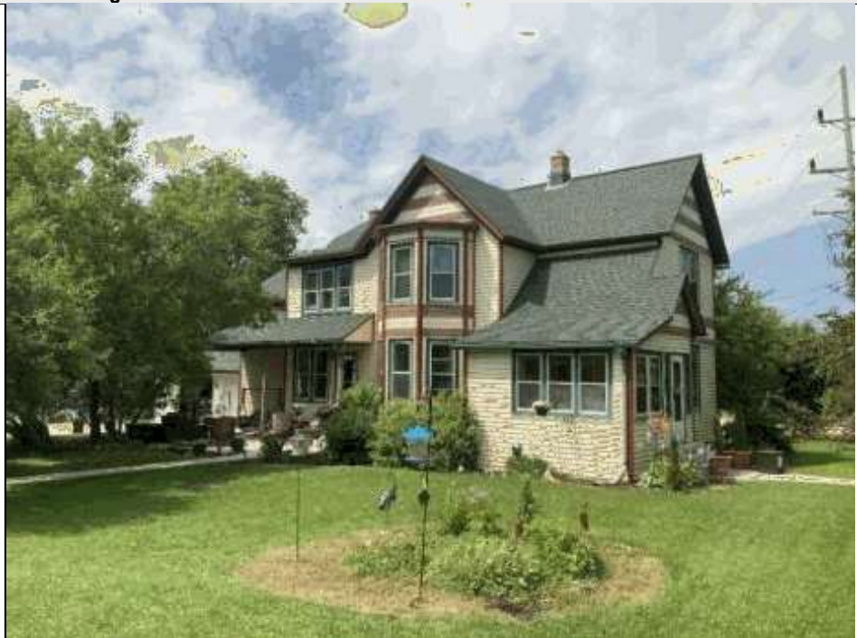
Total living area is 2,357 SF; building assessed value is $295,400