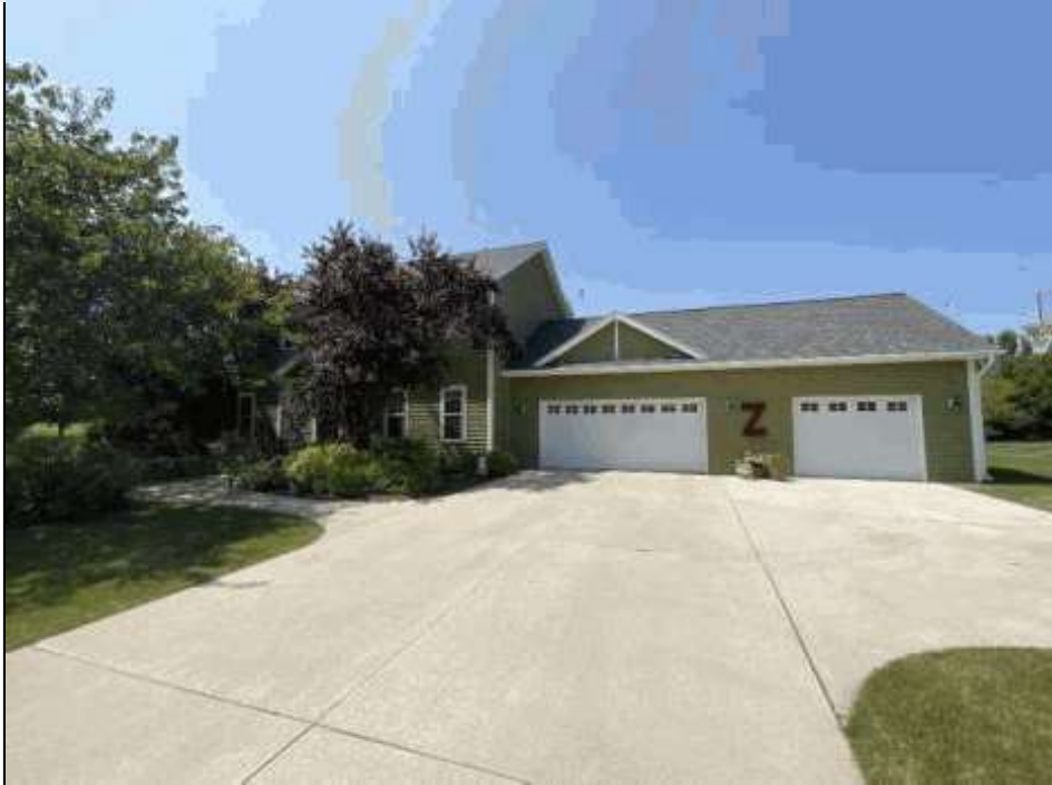
Total living area is 2,326 SF; building assessed value is $386,600